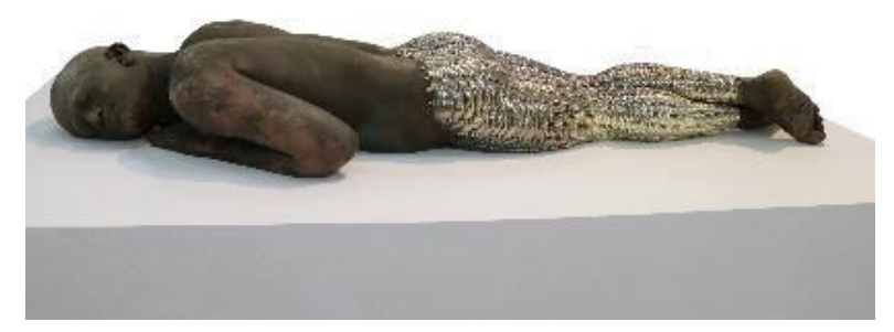
Deepak Behera, Suffering, fibre glass, chrome plating, and brass coating